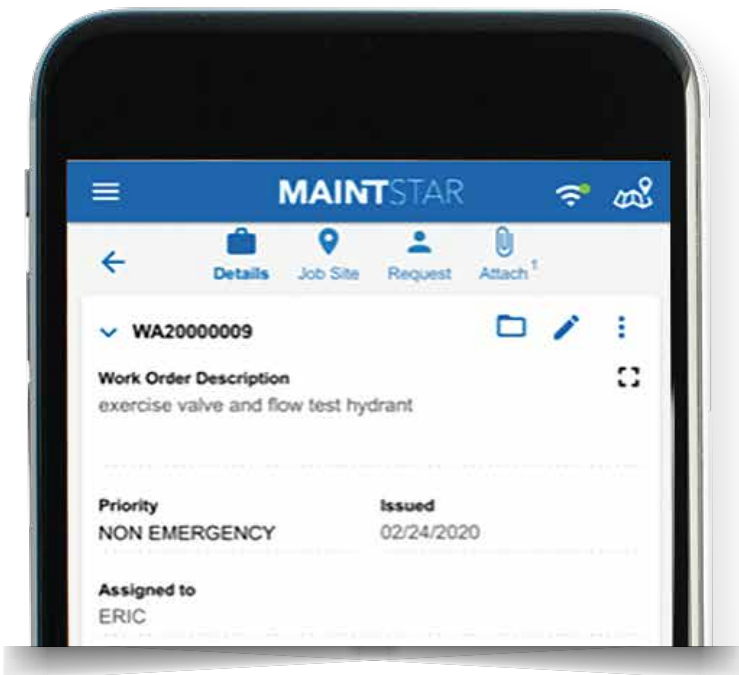
MOBILE WORK ORDER

Perform inspections, upload photos and more from the field.