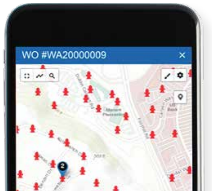
GIS CENTRIC MAP

System allows GIS referencing of all assets, work orders and tasks for both field and office staff.